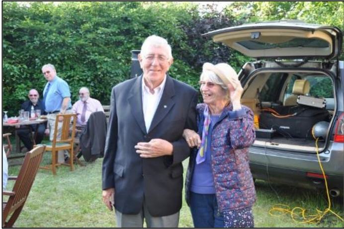
At the end of the evening our Provincial Prior gave a big thank-you to the Brother Knights of St Michael at Bisley Preceptory for hosting an excellent afternoon and evening.