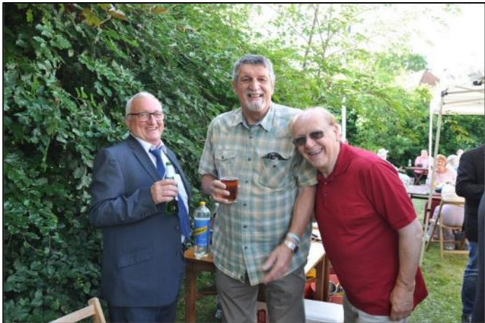
We had a great time eating and socialising with Brother Knights and friends.