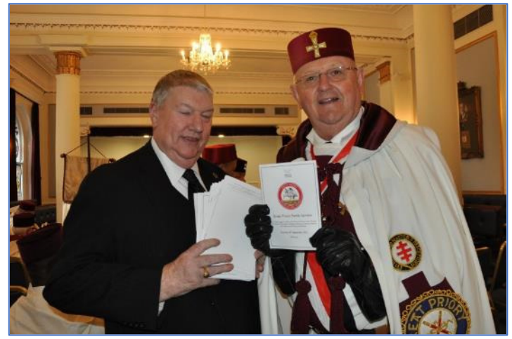
Present at the meeting were many honoured guests from London and other Provinces.

The Brother Knights were called to order to receive the visiting Provincial Priors and Knights Commander of the Temple