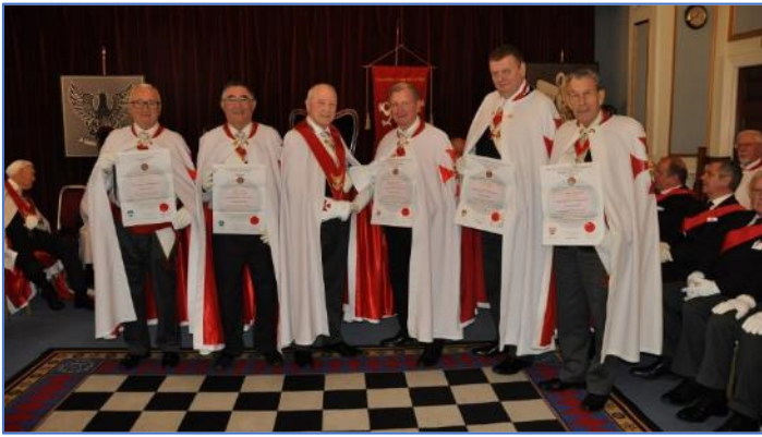
The Regional Grand Prefect had pleasure in presenting five KBHC Certificates to Reverend Knights promoted at the September meeting of the Prefecture St George at London No.1.